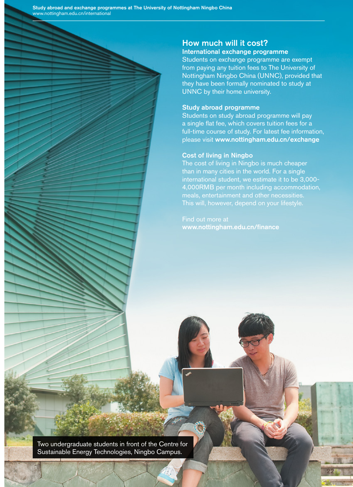
Two undergraduate students in front of the Centre for Sustainable Energy Technologies, Ningbo Campus.