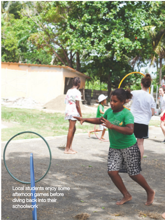
Local students enjoy some afternoon games before diving back into their schoolwork