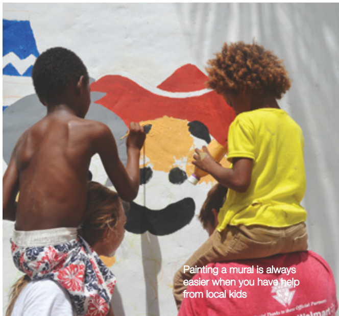
Painting a mural is always easier when you have help from local kids