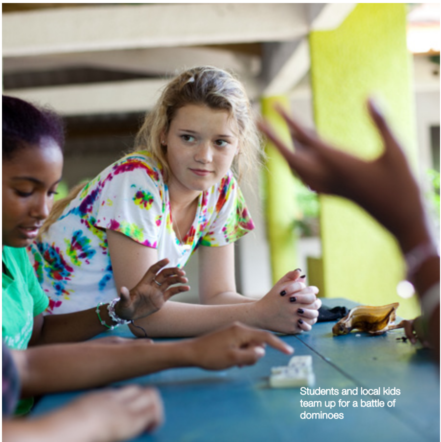
Students and local kids team up for a battle of dominoes

* Airport may change based on availability and project site location